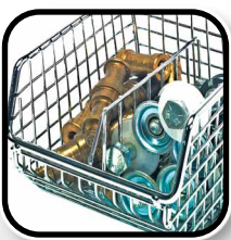
Shown with optional Divider (Sold separately)