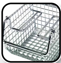
Shown with optional Side Stacking Ledge Pair (Sold separately)