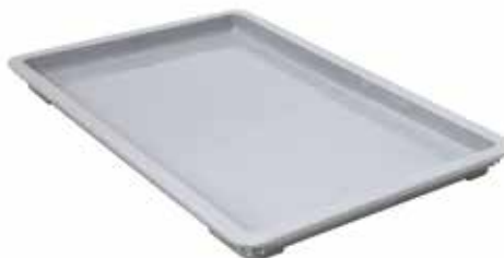
FSB-PL2618 25-5/8"L X 18"W X 1-3/4"H