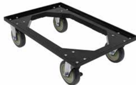
FSB-PTDLY 25-5/8"L X 18"W X 7"H Includes four 5" x 1-1/4" poly casters, two rigid, two swivel, one with brake. Available in Black.

Precision engineering and design ensures a space-efficient and secure stacked configuration to reduce the need for extra lids. The boxes withstand temperatures ranging from -40°F to 160°F. Colors: White and Gray.