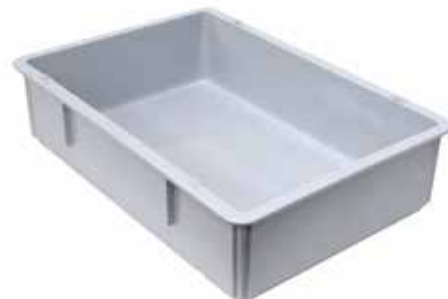
FSB-PT26186 25-5/8"L X 18"W X 6-3/8"H