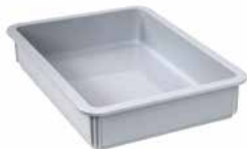
FSB-DT18133 17-3/4"L X 12-3/4"W X 3-3/8"H