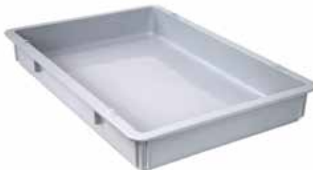
FSB-PT26183 25-5/8"L X 18"W X 3-3/8"H