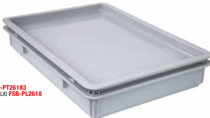
FSB-PT26183 Shown with LID FSB-PL2618