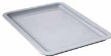
FSB-DL1813 17-3/4"L X 12-3/4"W X 3/4"H